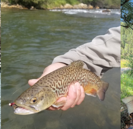
A rare Tiger Trout