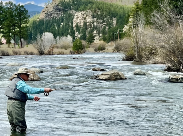
On the river at Rawhide