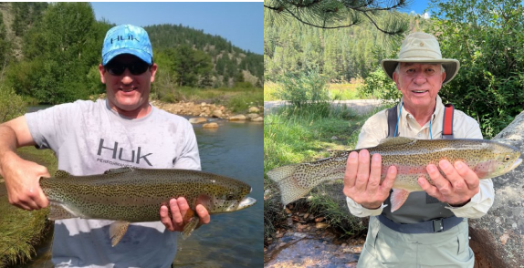
Vint's 27" Rainbow Don's 25" Rainbow