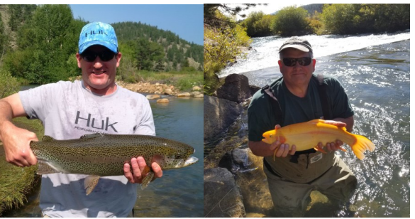
Vint's 27" Rainbow