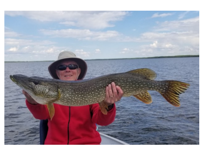
Catch a trophy before lunch