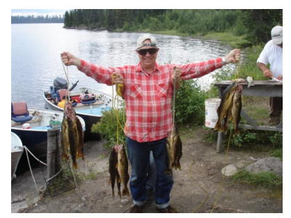
Bring Walleye for lunch