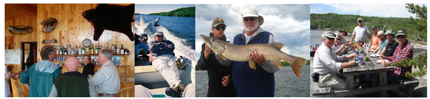
5:00 p.m. Happy Hour