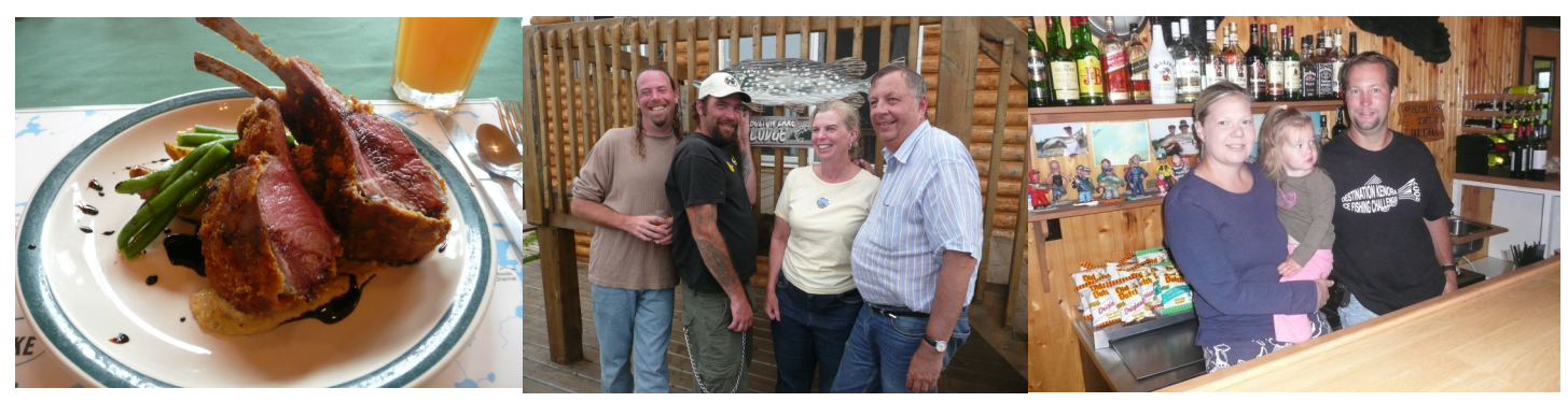
Dinner is always great

The lodge remains open for dessert and other refreshments until 11:00 p.m. The staff is wonderful, and the atmosphere is always fun and relaxing.