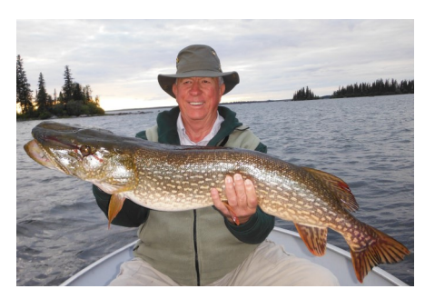
Catch a trophy after dinner