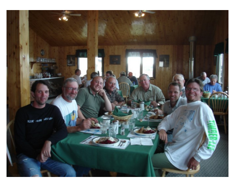
6:00 p.m. Dinner in the lodge