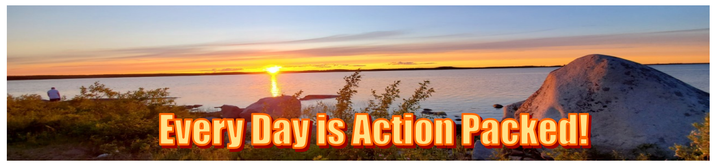
Sunsets at Bolton Lake can be spectacular—another reason to fish in the evening!